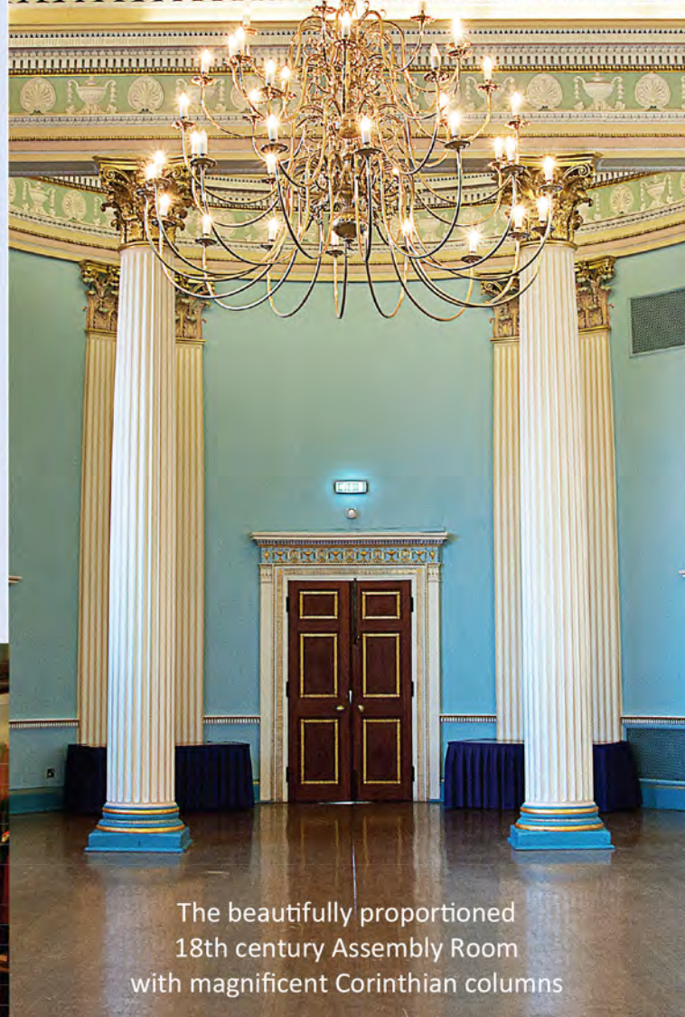
The beautifully proportioned 18th century Assembly Room with magnificent Corinthian columns